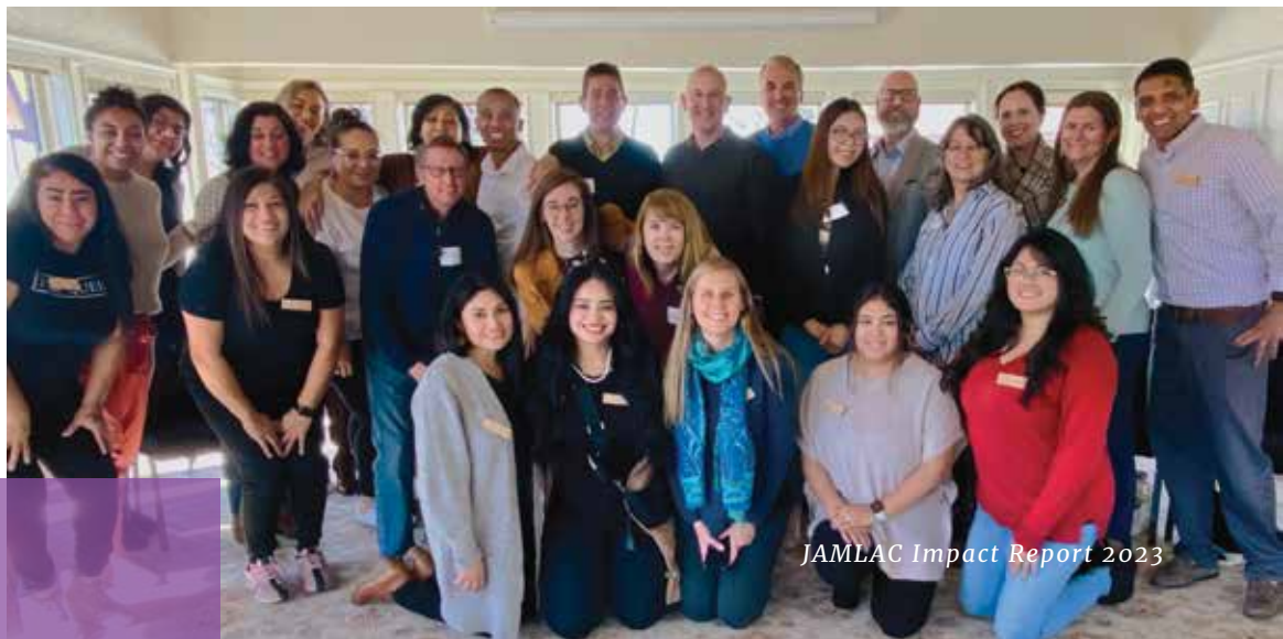
Right: JAMLAC Staff and Board Members (not all pictured)