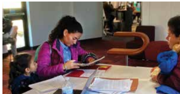
Above: Venezuelan Family receiving legal information.

"I was a Lieutenant in Venezuela and was treated as a traitor when I refused to harm innocent people. I signed up to defend my people and my country, not to destroy them. The government began to harass, threaten, and persecute my family and me."