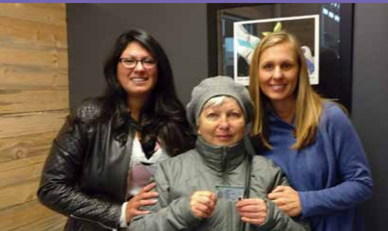
Left: Supporting a client through the legal process