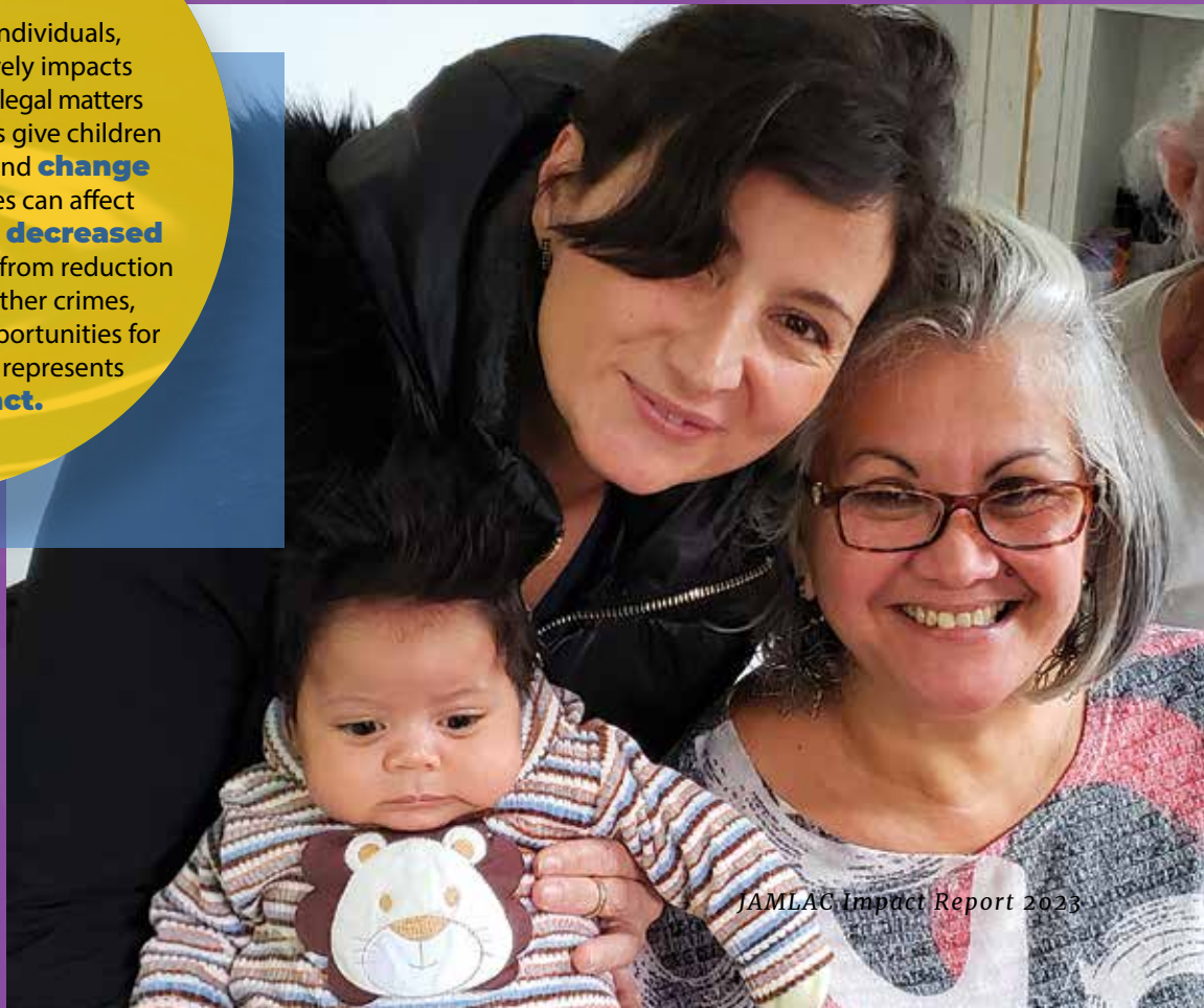
Right: JAMLAC client celebrating being reunited with her family – Grandma seeing her grandson for the first time.

We directly served 3,000 individuals, but our work in fact positively impacts thousands more . Many legal matters involve children ; the results give children better living environments and change their lives . Opportunities can affect generations to come, and the decreased cost to the community from reduction of domestic violence and other crimes, plus increasing economic opportunities for families and communities represents profound impact .